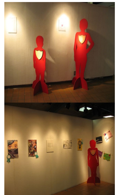
Domestic Violence Awareness Month~ RCC Wiseman Gallery October 2009