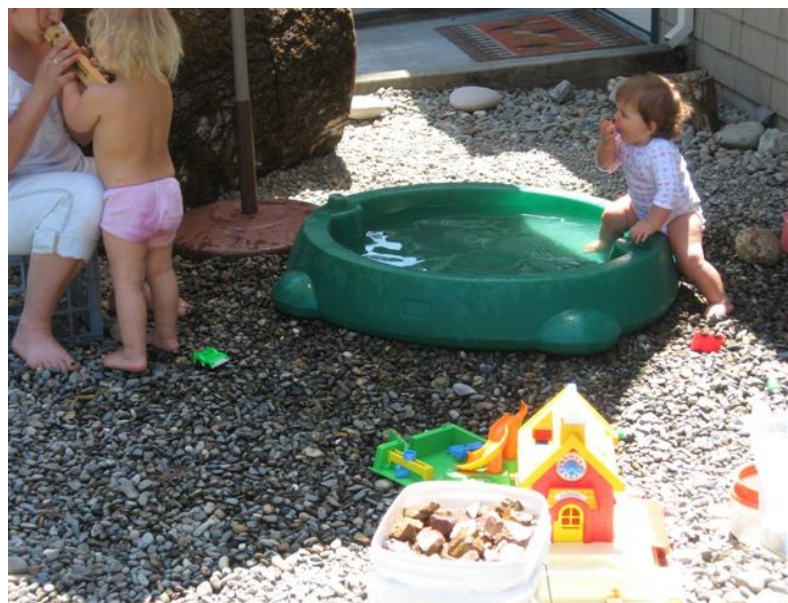
New Rock garden at WCST